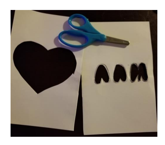
Step 1: Draw out a design for your stencil on cardstock. Stencils work best if your design is simple.

Step 2: Use scissors to cut out your stencil drawing. The parts you cut away will be the parts that paint or marker will go through. Fold or bend your stencil to cut out inside parts, or cut through the paper and tape up any cuts you don't want to keep.