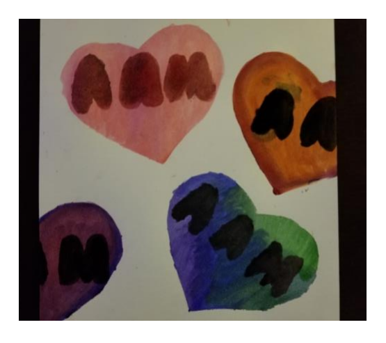
Step 3: Place a piece of paper underneath your stencil. Use markers or paint through your stencil to make your artwork. Hold down the edges of your stencil for easier coloring.

Step 4: Repeat your stencil as many times as you would like. Try layering, flipping, and rotating stencils.